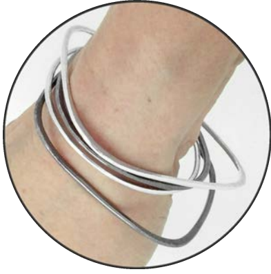
Bangles! Bangles! Bangles! with Paulette Werger March 2 + 4