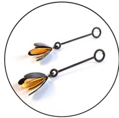
Steel Sheet Jewelry with Maia Leppo March 16 + 18