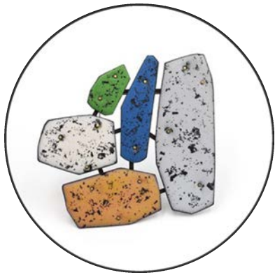
Get It Together: Rivets, Tabs and Other Simple Enamel Settings with Hannah Oatman March 5 + 12