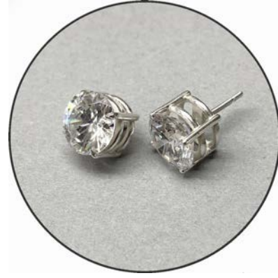
Stud Earring Fabrication with Steven Parker March 3 + 10